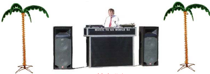
Unit # 1

Call us and check our Calendar of Events for availability. E-mail us soon at the following info@musictogomobiledj.com . View our web site at www.musictogomobiledj.com .