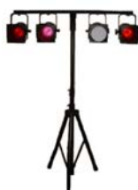
Fender Light Trees