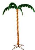
2 – Light up Palm Trees