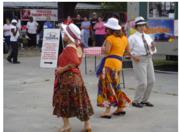
Dancers at a past Yemassee Shrimp Festival!

For more information on the Festival Events!