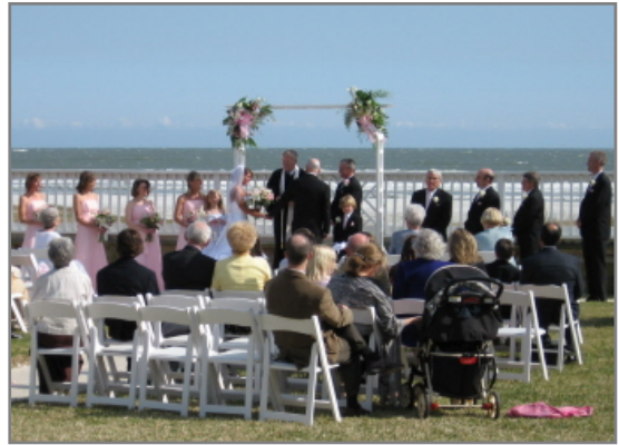
Beautiful views! Fripp Island Wedding by the Beach