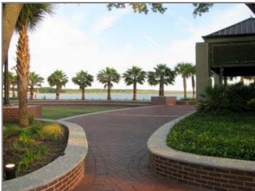
Beautiful Palm Trees and Water Views