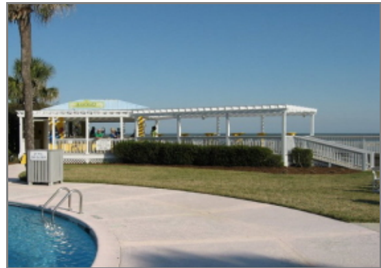
The Sand Dollar