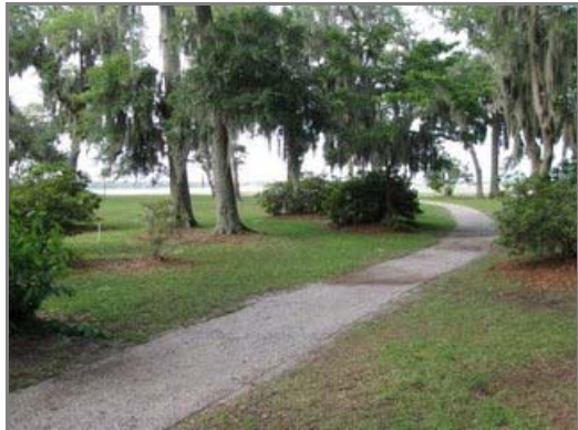
Nice winding path through the Park