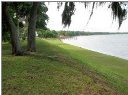
Green hill at back of the lot by the water