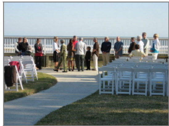
Lawn area on both sides of the Path