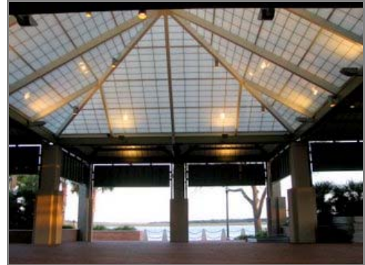
Inside the Pavilion