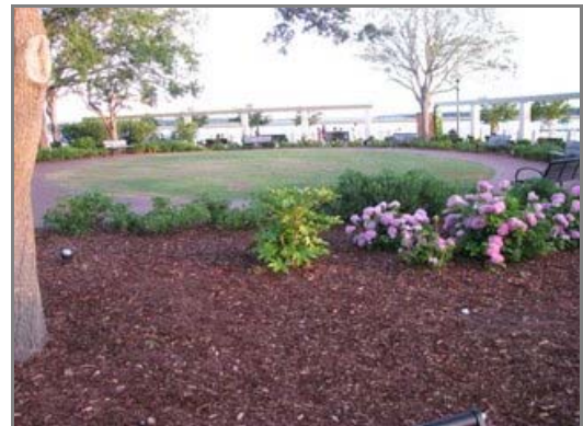
Circular Court Yard