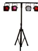
Fender Light Trees